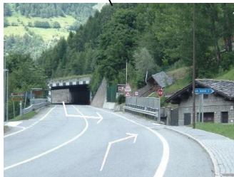
From MB Tunnel, turn at left for La Saxe