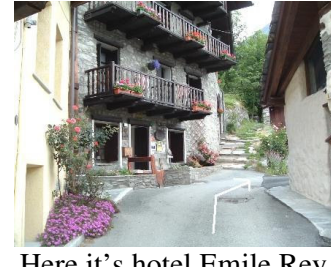
Here it’s hotel Emile Rey, You arrived !!