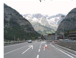
Round-about of center > Follow for Monte-Bianco