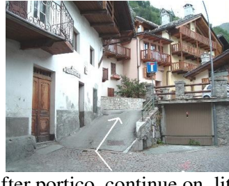
After portico, continue on little road on left