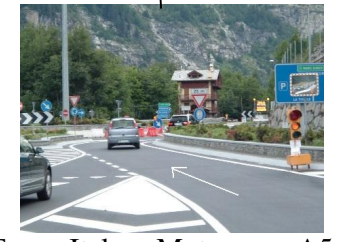
From Italy > Motorway A5 – exit Courmayeur > N.R. 26