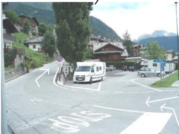
Lane that rich into the village