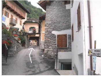
Narrow steep street in the village