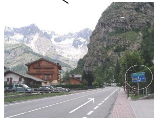
1 km after round-about, crossroad for La Saxe on right