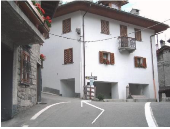
In the village, follow signs “Meubl  Emile Rey”